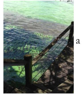
Toxic Algae St Lucie River

The State League's Water, Land and Wildlife Team has been establishing their environmental priorities for 2019. We have been telling them emphatically -- that the Martin County Leagues #1 Priority is water and that everything else is far-distant second. We have thus been urging the Florida League to focus their environmental efforts on water-related issues; issues that during the past year have severely impacted both water and wildlife from the Gulf Coast through Lake O to the Indian River Estuary.